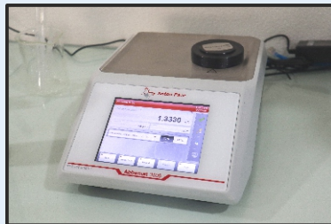
Anton Paar - Refracto Meter - for refractive index checks