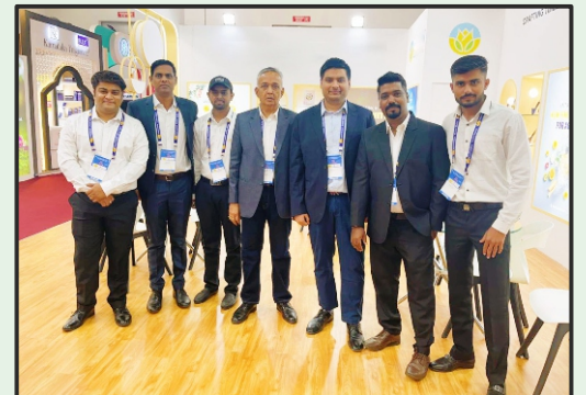
INTERNATIONAL AGARBATTI & PERFUME EXPO 2024, HYDERABAD