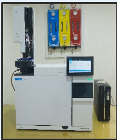
Agilent - Gas Chromatography System (GC) - for precise composition analysis