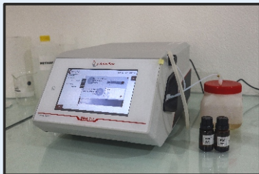
Anton Paar - Density Meter - for accurate density measurement