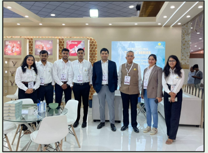
ALL INDIA AGARBATHI MANUFACTURERS ASSOCIATION EXPO 2025, BANGALORE